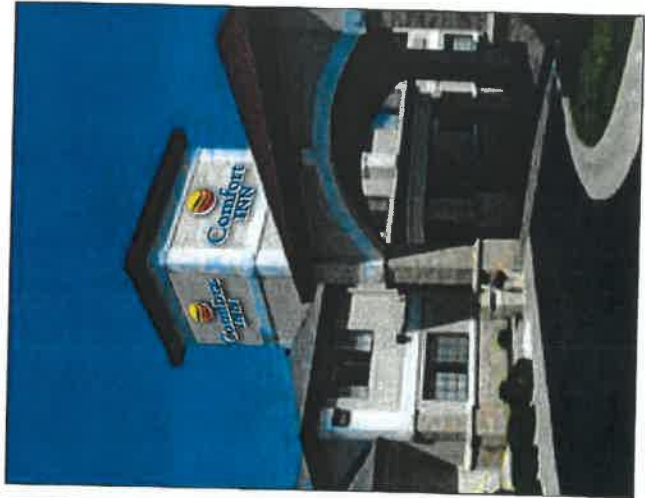
• INSTALL PROPOSED SIGNAGE