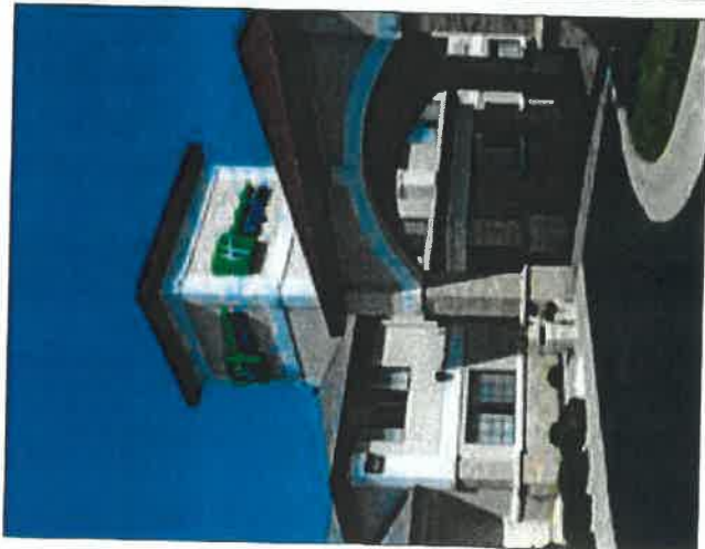
• RECYCLE OR DISCARD EXISTING SIGNAGE